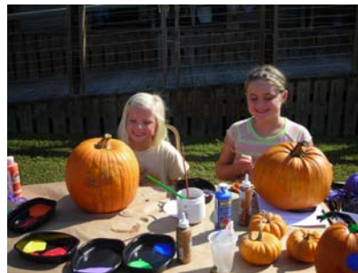
Pumpkin Decorating at the Festival