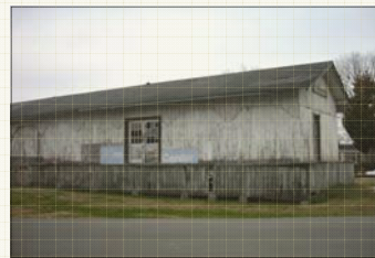
Shed Then (2/09)