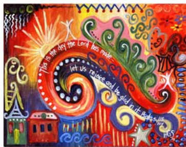
Psalm 118, Item#1023 To place an order call (910) 285-4940 or email us at hope@hopegsmith.com We'll get back with you with your order details promptly. Thanks!

Print 8x10, $35 11x14, $45 16x20, $75 18x24, $95 Framed & Matted 11x14, $55 16x20, $125 20x24, $195 22x28, $250