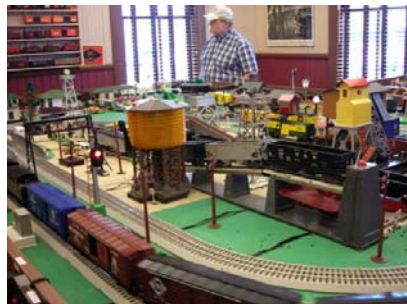
Model Train Room at Wallace Depot

Look for our ads in the Wallace Enterprise and Duplin Times and check our web site www.longleafguild.org